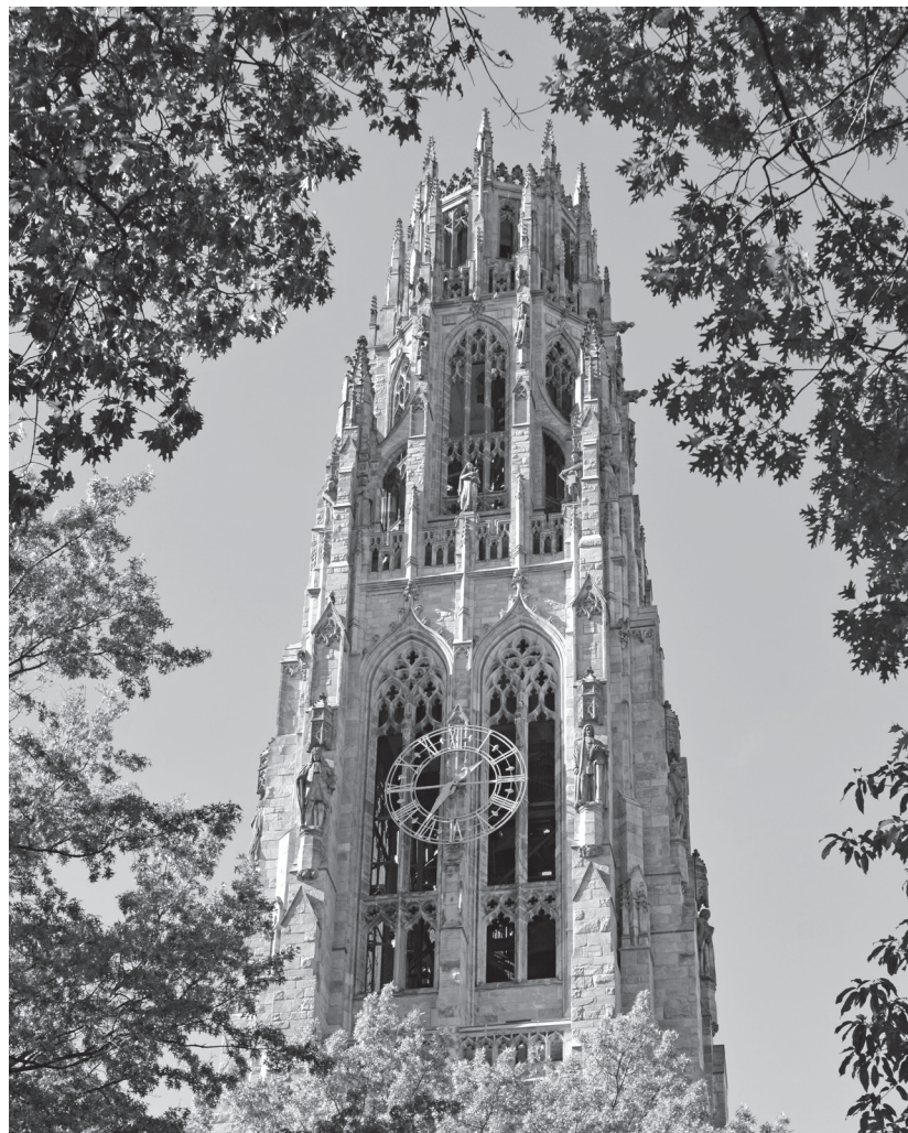
Harkness Tower, Branford College

Join us at Mory's for a no-host, cash-bar "meet and greet" social, where you can make new friends, greet fellow delegates, and meet members of the AYA Board of Governors and Yale Alumni Fund leadership.